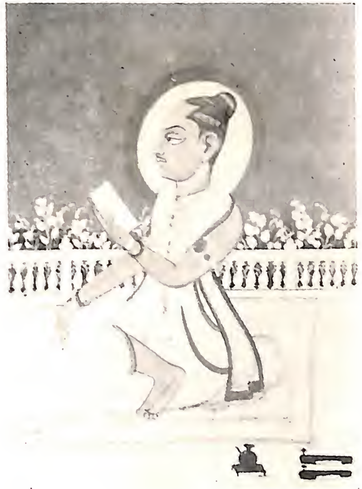
Goswami Shri Gokulnathji See page 343